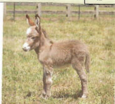
HHAA Watch Me Shine 2 inq

The American Donkey and Mule Society P.O. Box 1210, Lewisville, TX 75067 (972) 219-0781 The American Donkey and Mule Society is not responsible for errors in information submitted to the registry.