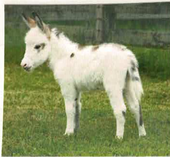
HHAA Cake Walk 4.jpg

The American Donkey and Mule Society, PO Box 1210, Lewisville TX 75067 www.lovelongears.com/ (972) 219-0781 The American Donkey and Mule Society is not responsible for errors in information submitted to the registry.