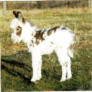
HHA A-Emoji 2.jpg

The American Donkey and Mule Society, PO Box 1210, Lewisville TX 75067 www.lovelongears.com/ (972) 219-0781 The American Donkey and Mule Society is not responsible for errors in information submitted to the registry.