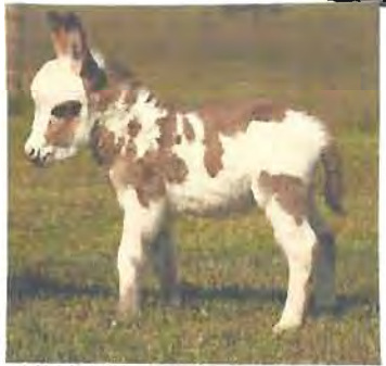
HHA Hez'n Cahoots 4.jpg

The American Donkey & Mule Soc PO Box 1210 Lewisville TX 75067 (972) 219-0781 www.lovelongears.com