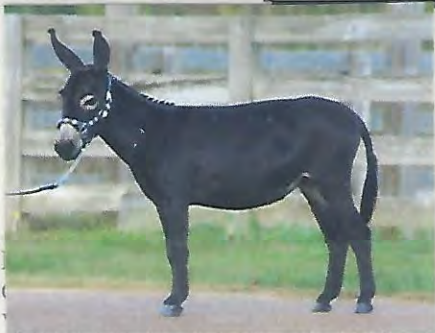
HHAA Kit Kat Kandy 2.jpg

The American Donkey and Mule Society P.O. Box 1210, Lewisville, TX 75067 (972) 219-0781 The American Donkey and Mule Society is not responsible for errors in information submitted to the registry.