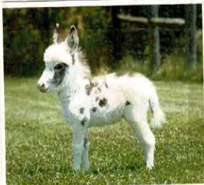
HHA Mini Mia 2.jpg

The American Donkey and Mule Society, PO Box 1210, Lewisville TX 75067 www.lovelongears.com/ (972) 219-0781 The American Donkey and Mule Society is not responsible for errors in information submitted to the registry.