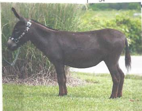
HHA Sweet Punch 2.jpg

The American Donkey & Mule Soc PO Box 1210 Lewisville TX 75067 (972) 219-0781 Www.lovelongears.com