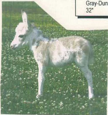
HHAA Little White Lie 2.jpg

The American Donkey and Mule Society, PO Box 1210, Lewisville TX 75067 www.lovelongears.com/ (972) 219-0781 The American Donkey and Mule Society is not responsible for errors in information submitted to the registry.