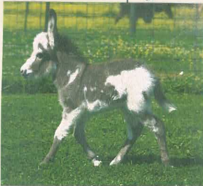
HHAA ShAmy 4 ing

The American Donkey and Mule Society. PO Box 1210, Lewisville TX 75067 www.lovelongears.com/ (972) 219-0781 The American Donkey and Mule Society is not responsible for errors in information submitted to the registry.