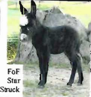
FoF Star Struck

Donkey and Mule Society Lewisville, TX 75067 (972) 219-0781 Donkey and Mule Society is not responsible for information submitted to the registry.